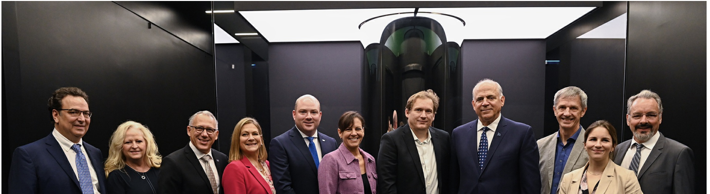
IBM and PINQ 2 launched Canada's first IBM Quantum System One at IBM Bromont. Officials from PINQ 2 , the Government of Québec, and IBM were on hand for the unveiling, September 22, 2023. (Credit: CP Images for IBM.)*

The arrival of the quantum computer in Quebec consolidates its leadership position, promotes research, develops quantum talent, and propels Quebec as a world reference in sustainable development.